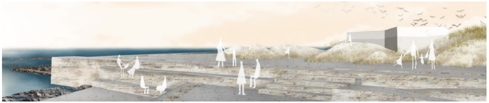
Abi Sendall (MLA 2020)